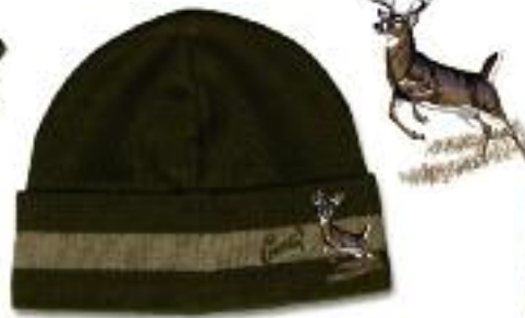
White-tailed Deer Beanie MHA13231 • (OLI) olive