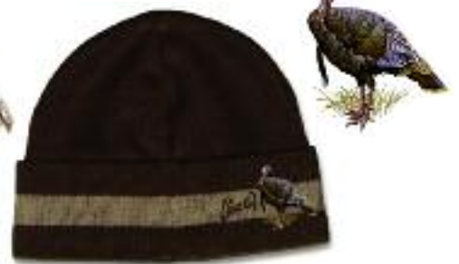
Wild Turkey Beanie MHA13241 • (BRN) brown