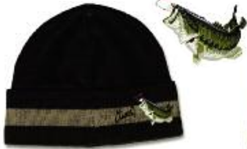
Spinner Bass Beanie MHA13221 • (BLK) black

Acrylic knit with polyester sweatband on inside; embroidered art on rolled cuff. One size fits all.