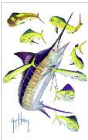
Marlin Dorado Towel