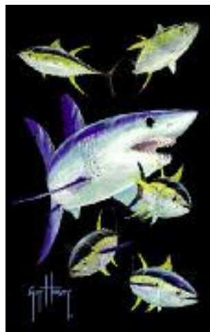
Mako Shark Towel