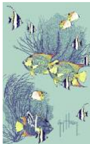
Under The Sea Towel